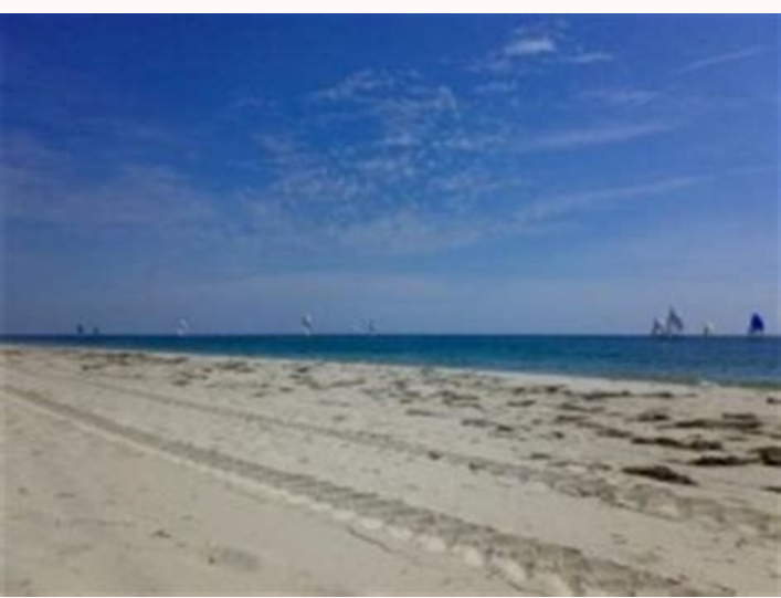
Camping ria formosa cabanas de tavira.